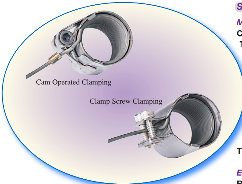
Cam Operated Clamping