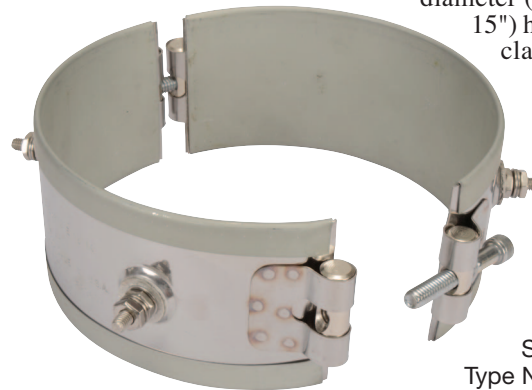
Shown with Type NS Built-In Strap

NOTE: Multiple segment designs are recommended on larger diameter (typically larger than 15") heaters to improve the clamping force and