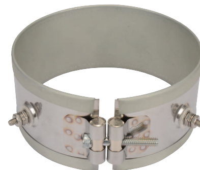
Type NB Shown

Type NB—One-Piece Band Min. ID: 2" (50.8 mm) Min. Width: 1-1/4" (31.8 mm)