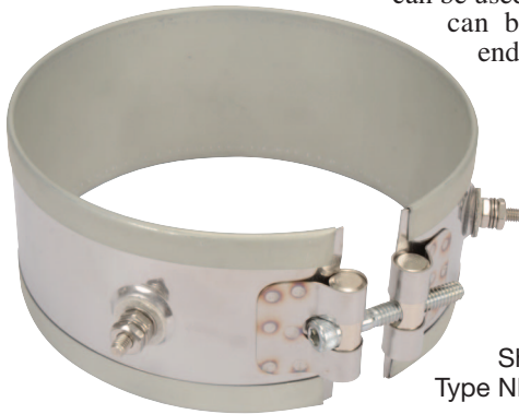
Shown with Type NB Built-In Strap

The one-piece construction is available on any screw or lead termination and clamping variation. It can be used where band heaters can be slipped over the end of the cylinder.