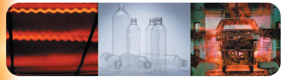
Complete Infrared Heat Technology for Every Industrial and Commercial Application Under the Sun