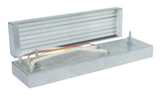
Style S - Two 10-32 Studs × 1" on centerline (Shown with Translucent Tubes and T/C)

Style C KTE and KTG E-Mitters have a Standard Ceramic Mounting Head and are interchangeable with CRC, CRB, CRN and CRZ Ceramic E-Mitters.