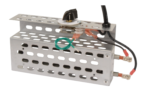
Tubular Heater See Page 11-115