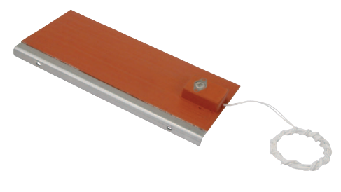
Silicone Rubber Heater See Page 9-18