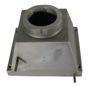
Hopper Feed Cooler