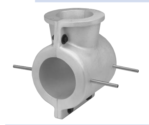
Feed Throat Cooler