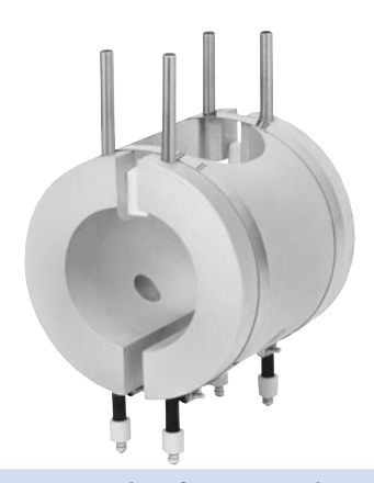
Large Holes for Vented Barrels