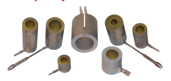
Cast Bronze Nozzle Heater Bushings For Runnerless Molding