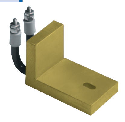
"L" Shaped Heater