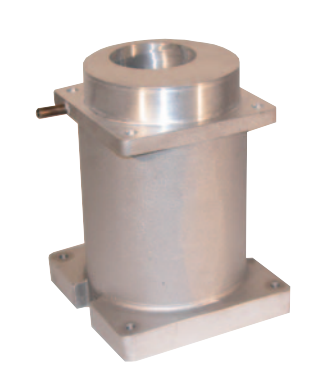
Feed Throat Cooler