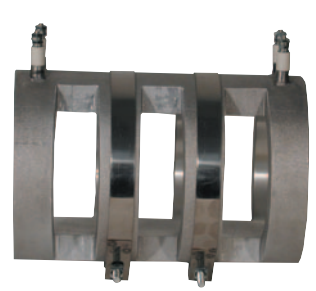
Vented Barrel Heater