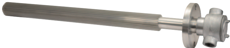
Optional NEMA 4/7 Housing

Type FAH heaters are primarily designed for use in oil heating and oil separation systems at immersion media temperatures not exceeding 250°F. Heaters must be used with suitable high-limit temperature controls to keep the external aluminum finned surface area from exceeding 500-550°F. A liquid level sensor is required to insure that the heater is always fully immersed. Heater must not be allowed to operate if not fully immersed or there is no or low liquid flow (below 2 gpm). If used for heating static liquids in a tank, an internal high-limit thermocouple and an external temperature control set to 700°F should be used. See catalog Section 13 and 14.